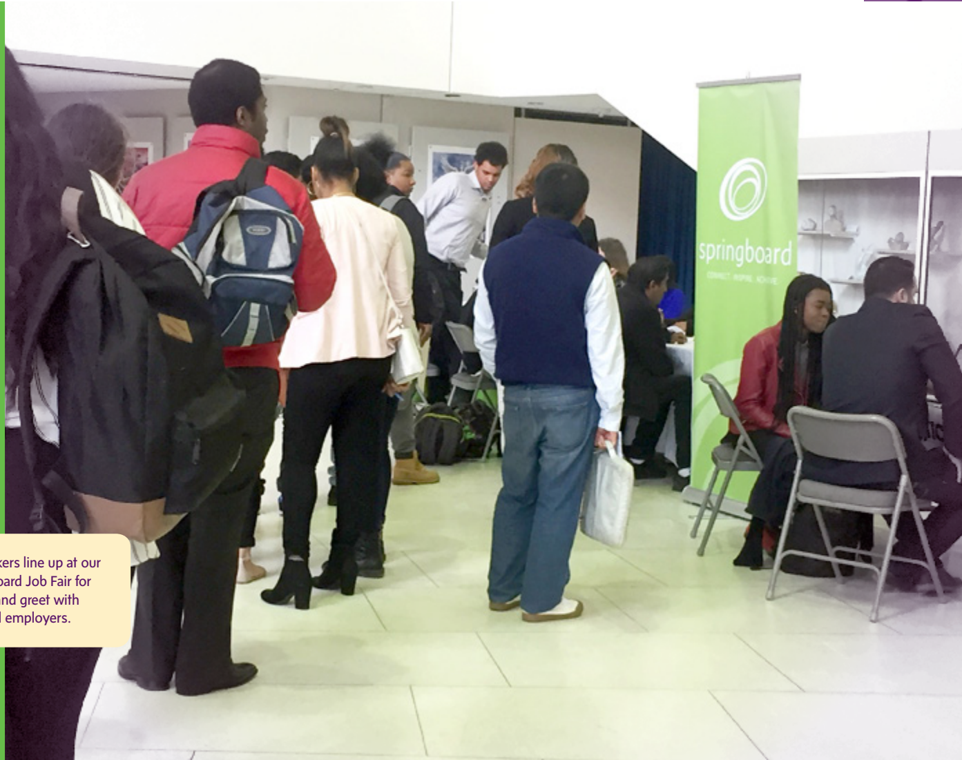
Job seekers line up at our Springboard Job Fair for a meet and greet with potential employers.

Here at Springboard, we meet confident, resilient and determined youth every day. But they often face personal struggles, and barriers to transitioning successfully to adulthood. Our programs and services welcome these diverse young people and empower them to “dream big”. Youth share ideas, learn new skills, and connect to work and training opportunities, helping them to make a better future for themselves.